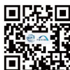
2026年出国展览计划 2026 International Exhibition Plan

围绕海外参展提供全流程配套服务 Provide end-to-end support services for participation in overseas exhibitions